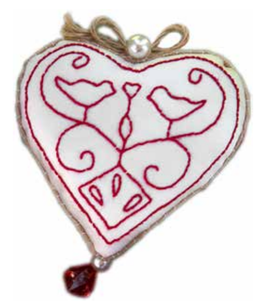
Tip I used a small scrap of cream satin that I got from my local bride shop for this project – if you ask they usually have offcuts from altered wedding dresses they will be happy to give you.